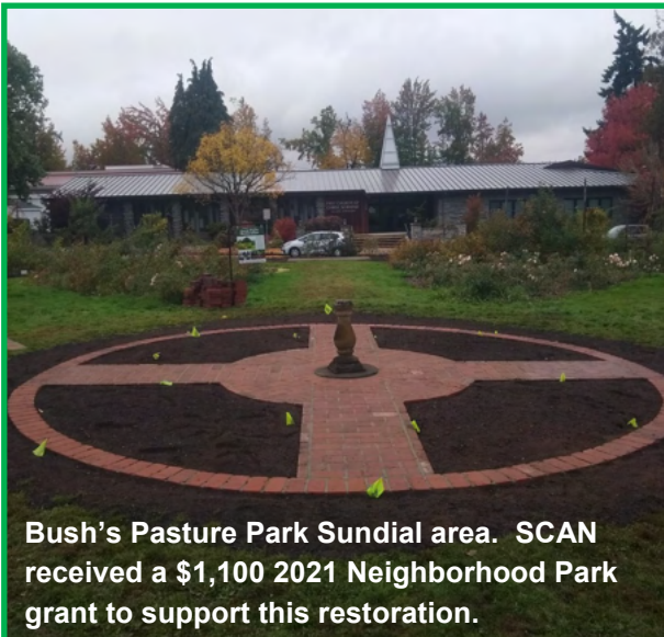
Bush's Pasture Park Sundial area. SCAN received a $1,100 2021 Neighborhood Park grant to support this restoration.

Eco-Earth in the snow with a heart around some of the holes in the surface caused by fallen tiles.